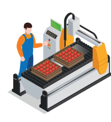
Safety and Quality