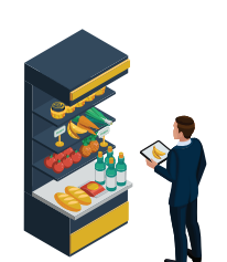
Retail, Restaurant and ecommerce