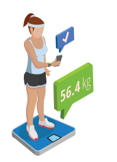
Personalized Nutrition and Food Experience